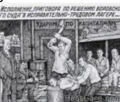
Jewish Bolsheviks Carried Out Mass Executions of Christians, Murdering them by Tens of Million