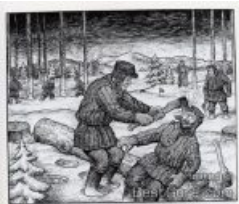
Prosecutor General Andrey Vyshinsky Ordered NKVD Staff to Use Brutal Torture with Pump, Soldering Iron, Bottle Shoved Into Vagina or Anus, Rats Placed in the Heated Bucket, etc.