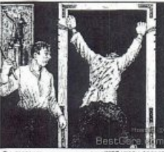
Brutal Beatings of Gulag Inmates by NKVD Jew Servants