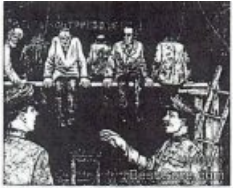
Jews Forced Imprisoned Christians to Sit on a Roost Inside a Desecrated Church for Days and Subjected Anyone Who Fell to Unspeakable Beatings