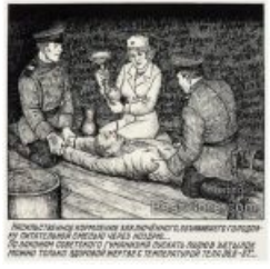
Gulag Prisoner Who Went on Hunger Strike Is Being Force Fed Through His Nostril