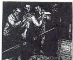
Enemy of the State Being Drowned to Death in a Barrel of Feces