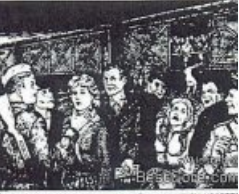
Gulag Guards Sold Captured German, Polish and Baltic Women to Convicted Felons to Be Gang Raped as Sex Slaves