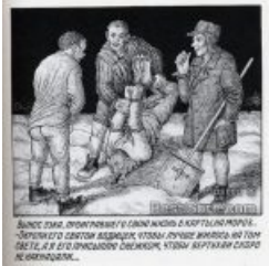
Gulag Inmate Whose Life Was Lost in Card Game Is Being Pissed On Before Being Left to Freeze to Death