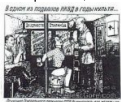
Convicted Felons Were Allowed to Murdering Enemies of the Nation with Electrocution, Stabbing, Hanging, Decapitation, Insertion of Crowbar Into Anus, etc.