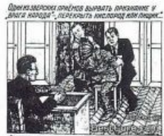
Plastic Bag Suffocation Combined with Beatings Was a Popular Method to Extract "Confessions" from Enemies of the State