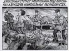
Known for Thier Inbred Homosexuality, Jewish Bolsheviks Often Sodomized Inmates in Gulags by Inserting Large Objects Up Thier Anuses