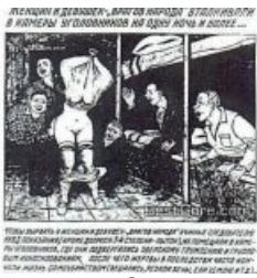
As Part of Torture, Christian Women Were Given to Convicted Criminals to Gang Rape at Will, Many Were So Brutalized, They Ate Soil to Commit Suicide