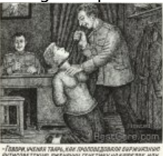
Humiliation of Christian Women by Jewish Bolsheviks in Gulags