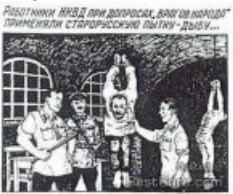
Strappado Was Another Popular Method to Extract Confessions form Enemies of the State in the Gulags