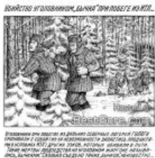
Gulag Escapees Often Resorted to Cannibalism to Survive in Harsh Russian Tundra