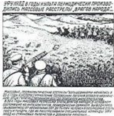
Mass Execution of Enemies of the People by NKVD - These Mass Murders Began in 1920s in USLON (Solovetsk Special Camps Command), the Predecessor of Gulag, Creation of the Jew