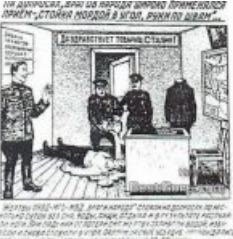
Interrogated Enemies of the State Were Forced to Stand on Their Feet for Days Without Rest, Food, Water and Sleep. When Victims Fell Down Unconscious, They Were Beaten and Forced to Stand Again