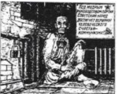
Chained Enemy of the State Was Forced to Defecate Into His Own Food Bowl