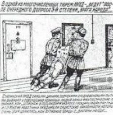
Slavic Christian Subjected to Medieval Torture by NKVD Officers Is Being Dragged Back to His Cell