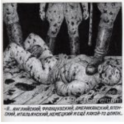
Tortured Gulag Inmate Confesses to Being an English, French, American, Japanese, Italian, German and Whatever Other Spy Jewish Bolsheviks Needed Him to Confess To