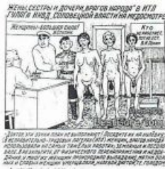
Overworked Women Suffered Vaginal Prolapses as a Result of Strain and Starvation in ITLs. Weakened and Ill Ones Were Finished Off by Deprivation of Food