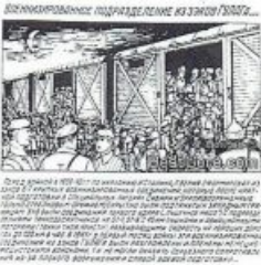
Gulag Prisoners Used by Jews as Cannon Fodders in World War II