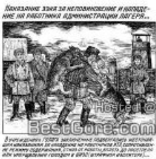
Gulag Guards Set Dogs on Disobedient Inmate

Without any further ado, below is an extensive gallery of drawings from the book by Danzig Baldaev titled "Drawings from the Gulag". I accompany each drawing with brief text explaining what the drawing is about: