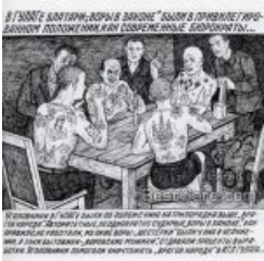
Jewish Bolsheviks Valued Convicted Felons More than Devout Christians and Allowed Them to Wager Lives of Enemies of the State