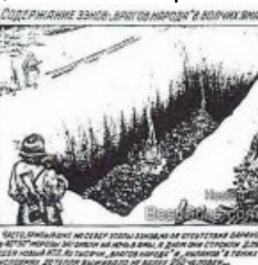
While Building Gulags for Themselves, Enemies of the State Slept in Pits, Barely a Quarter Lasted Until Spring