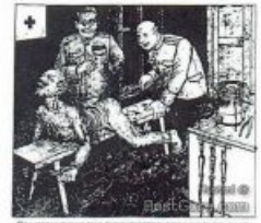
Administrators of Ispravitelno-Trudovoi Lager (ITL) or Corrective Labor Camp Pick Their Sex Slaves from Among Family Members of Arrested Enemies of the Nation